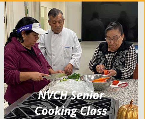
NVCH Senior Cooking Class