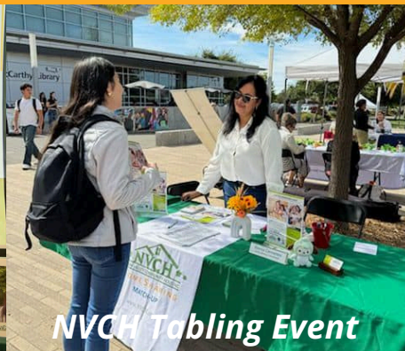
NVCH Tabling Event