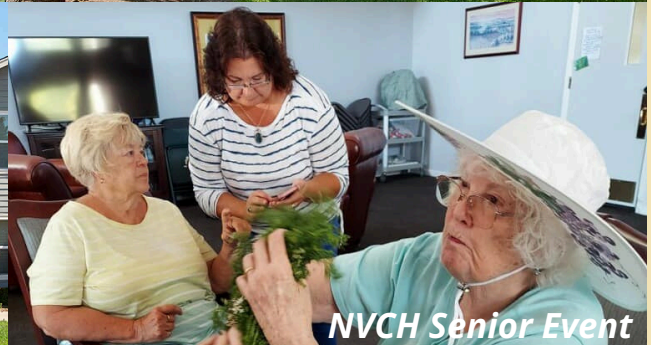
NVCH Senior Event