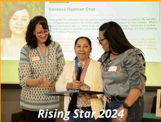
Rising Star 2024

Stay Connected: Sign up for our newsletter to see the difference your generosity creates and stay inspired by stories of impact.